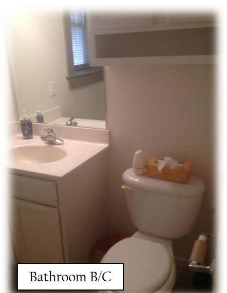
- 19 - Last Revised: 7.22.14